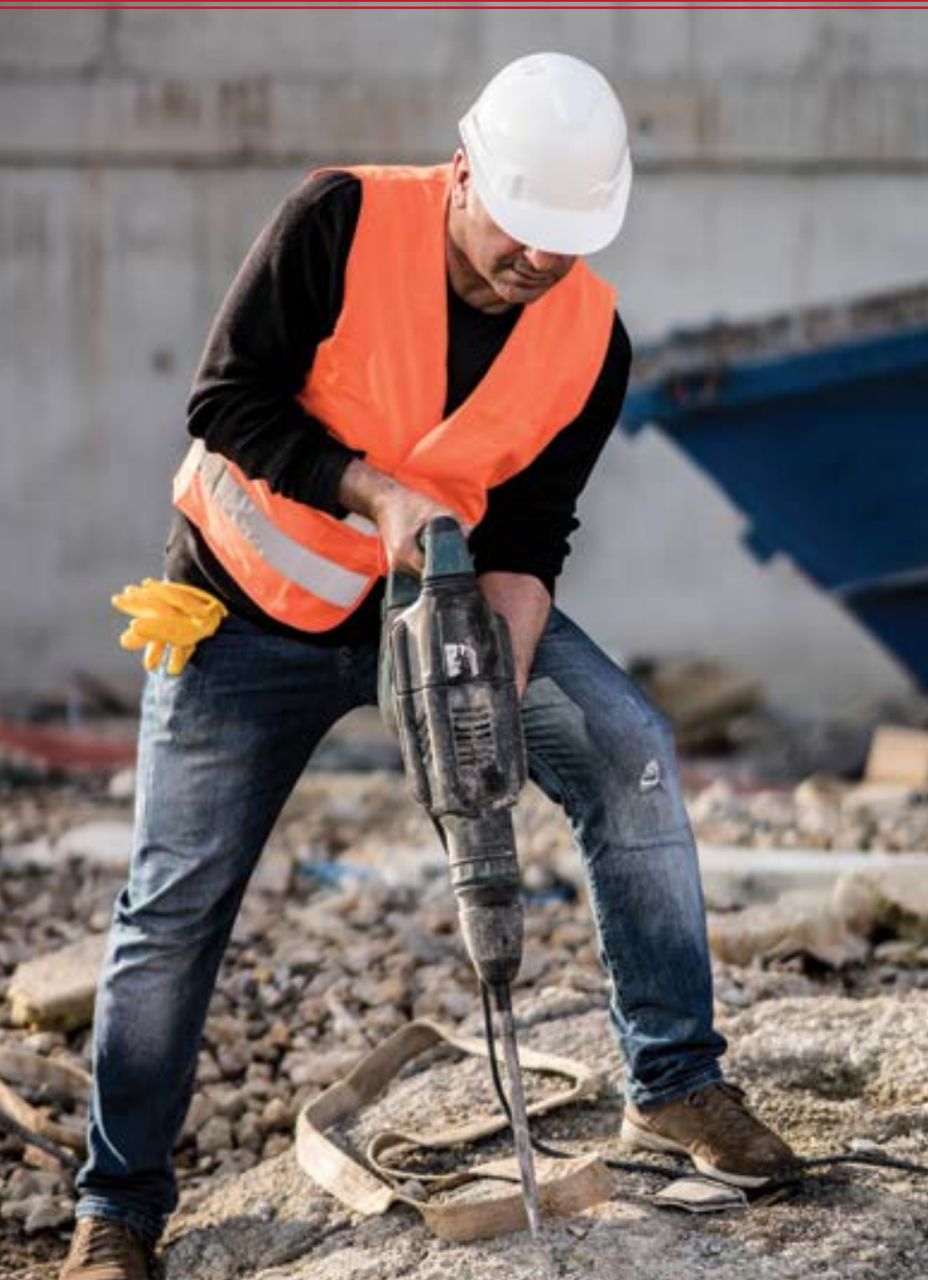
Tools that emit vibrations can cause debilitating effects on workers' fingers and hands.